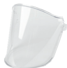
PROTECTIVE COVER for SPARTUS® Ultra NX47 helmet