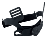
HEADGEAR for SPARTUS® Ultra NX47 helmet