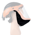
SEAL for SPARTUS® Ultra NX47 helmet