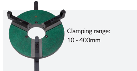
Product code: SP029-00-301P