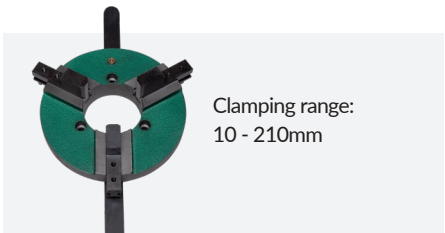
Product code: SP029-00-200P