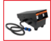
WIRED FOOT PEDAL