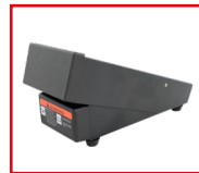
WIRELESS FOOT PEDAL