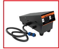
WIRED FOOT PEDAL