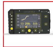
REMOTE CONTROL PANEL