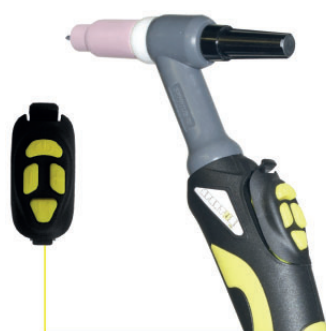
Fast replacement microswitch SPARTUS® Pro 4B with UP & DOWN remote control

The torches are available in the standard version with a ground cable and gas tube, or in one of the many extended packages. They include the top class original Polish SPARTUS® ProTIG torch with 4B ( UP & DOWN ) fast replacement microswitch. The packages are available with a torch (4/8m) on a standard handle or a light mini handle. A small toolbox of service parts enables fast replacement of used and worn parts. The torches contain a flexible packet of cables in cotton wrapping with 1m of leather for the handle.