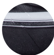
textile-rubber cable package cover