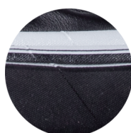
textile-rubber cable package cover