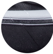
textile-rubber cable package cover