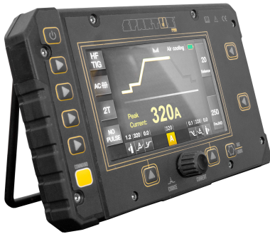
Wireless remote controller for ProTIG 321P