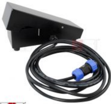
Standard foot pedal