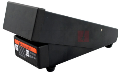
Wireless foot control