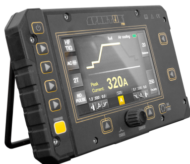
Wireless remote controllers for ProTIG 321P