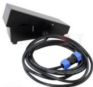
Standard foot pedal