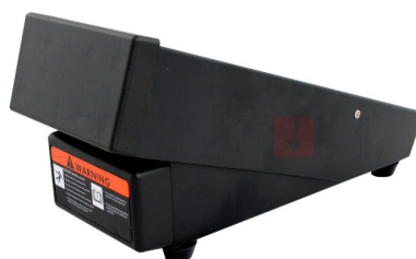
Wireless foot control