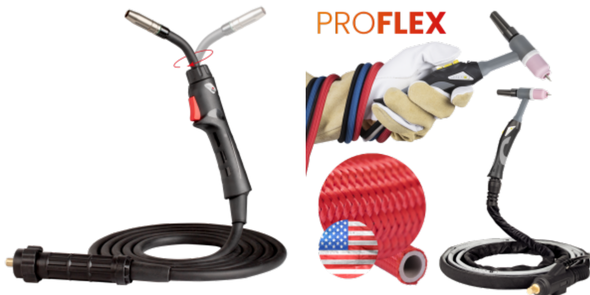
SPARTUS® 150R gun with a rotary torch head