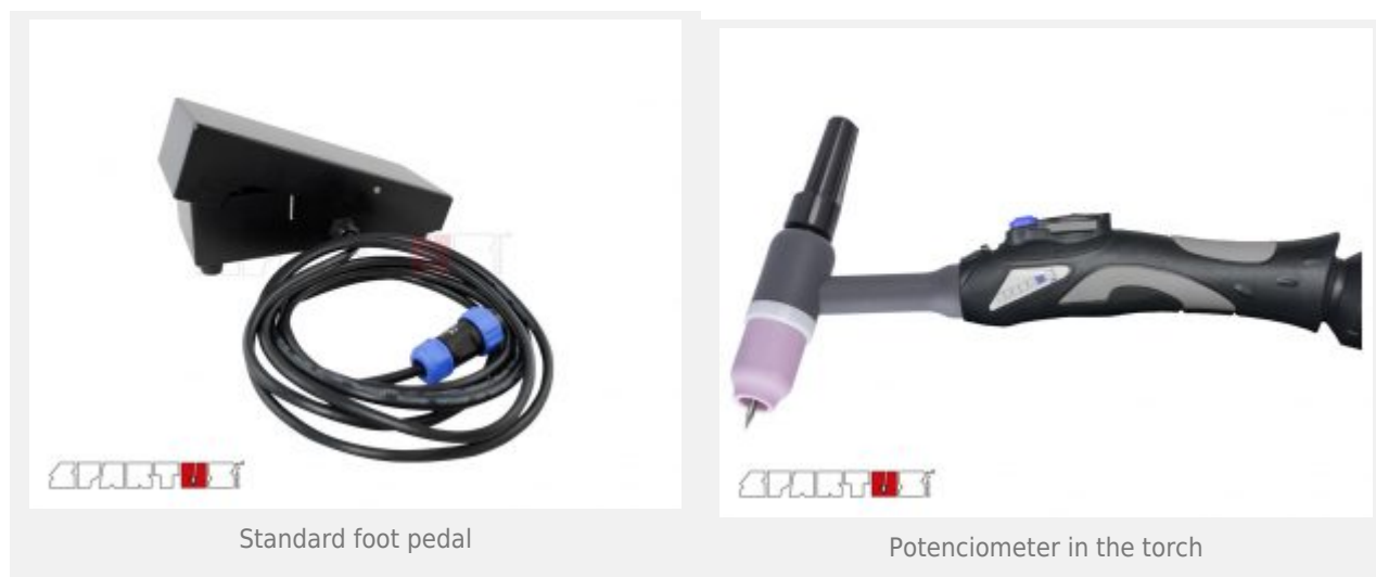
Standard foot pedal