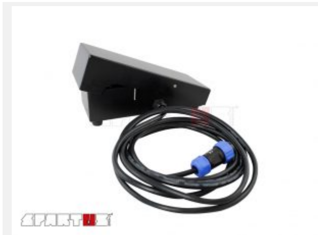
Standard foot pedal