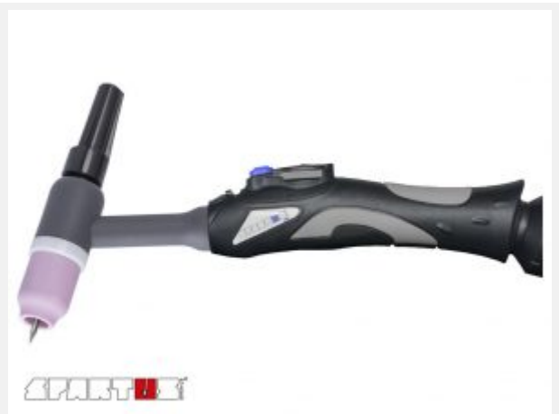
Potenciometer in the torch