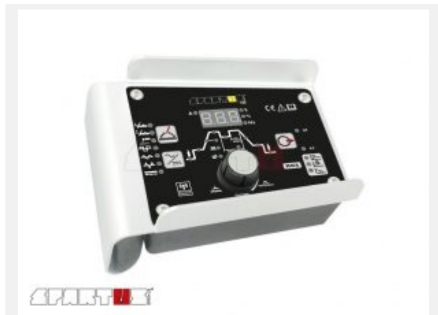
Pilot zdalnego sterowania TIG 320P/400P AC/DC