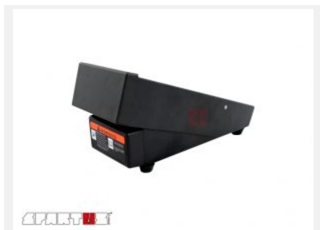
Sterowanie nożne bezprzewodowe