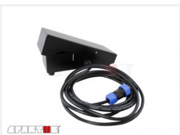
Sterowanie nożne przewodowe