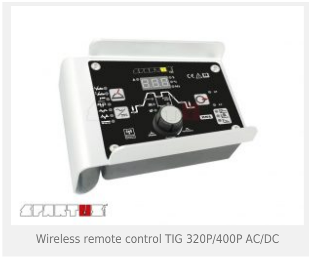
Wireless remote control TIG 320P/400P AC/DC