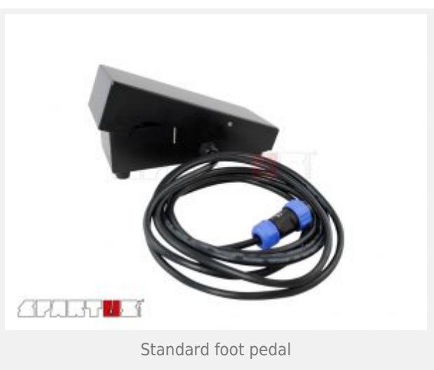
Standard foot pedal