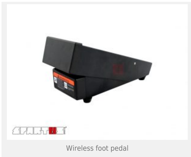
Wireless foot pedal