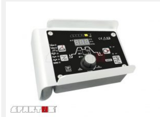
wireless remote pilot TIG 320P/400P AC/DC