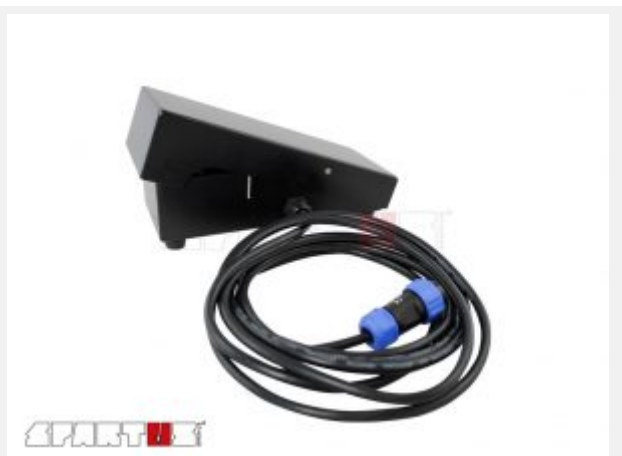
Standard foot pedal