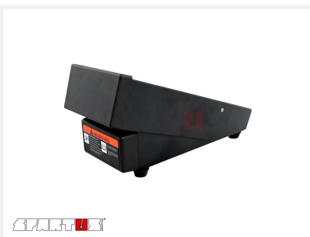
Wireless foot control