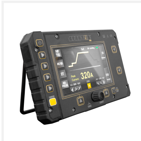
Wireless remote controllers for ProTIG 225P