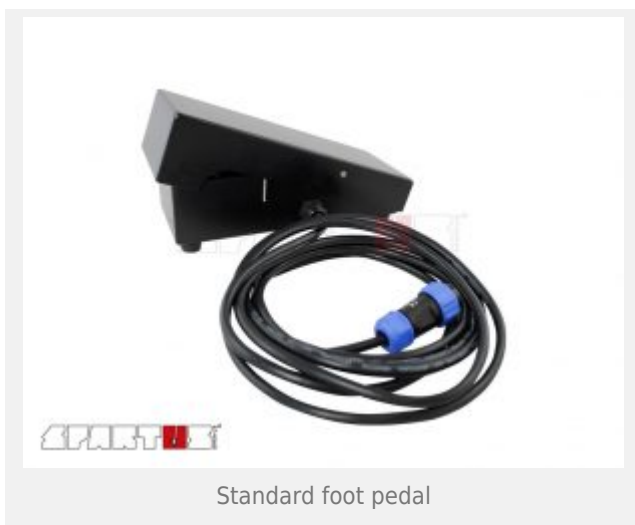
Standard foot pedal